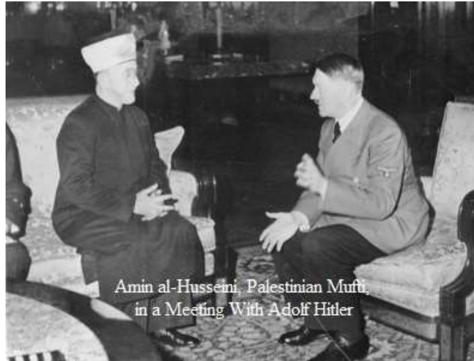
Amin al-Husseini, Palestinian Mufti, in a Meeting With Adolf Hitler

position and approach to protect the Jews of Iran versus the open hostility of Amin al-Husseini, the Palestinian Mufti of Jerusalem at the time, who during his several meetings with Hitler, encouraged him the more to massacre the Jewish people.